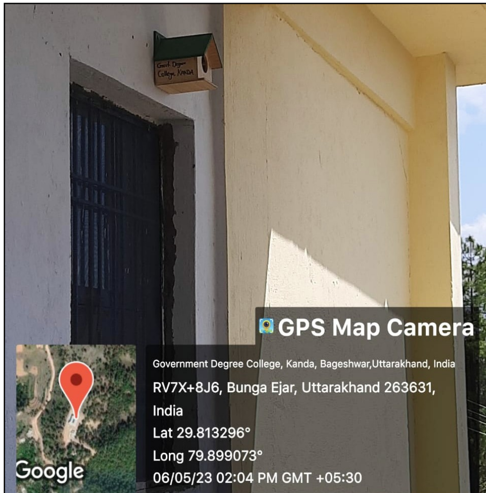
ECO-FRIENDLY HOUSE FOR SPARROW CONSERVATION ESTABLISHED AT GOVERNMENT DEGREE COLLEGE, KANDA