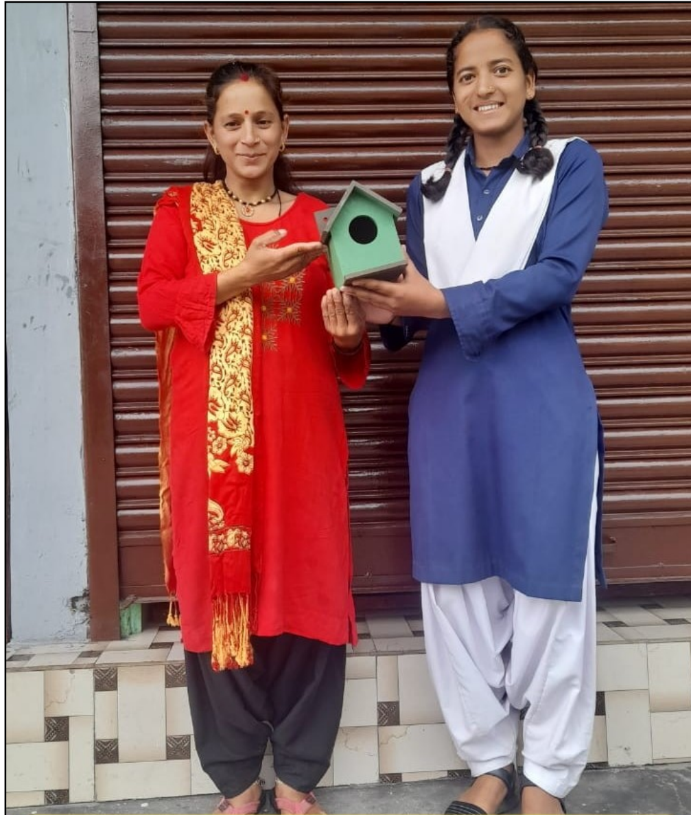
House Sparrow Conservation Practice Distribution of Sparrow Houses to the locals