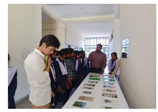
Some glimpses of the visit at CSIR-CIMAP Purara, Bageshwar