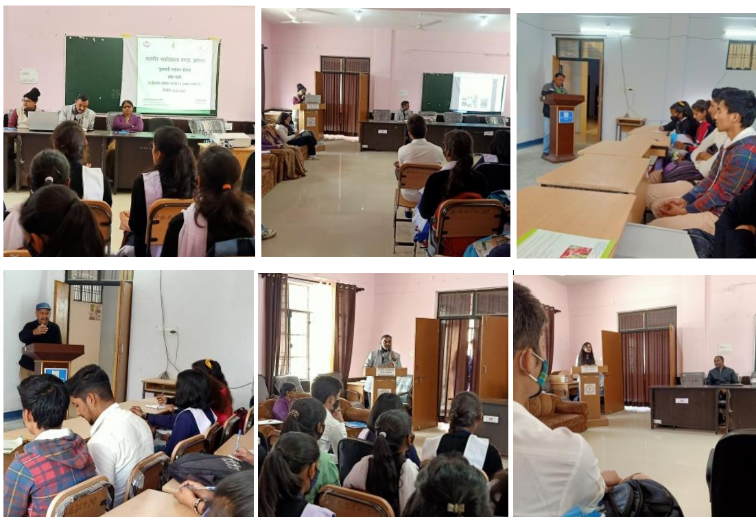
Some glimpses of organized training program at GDC Kanda